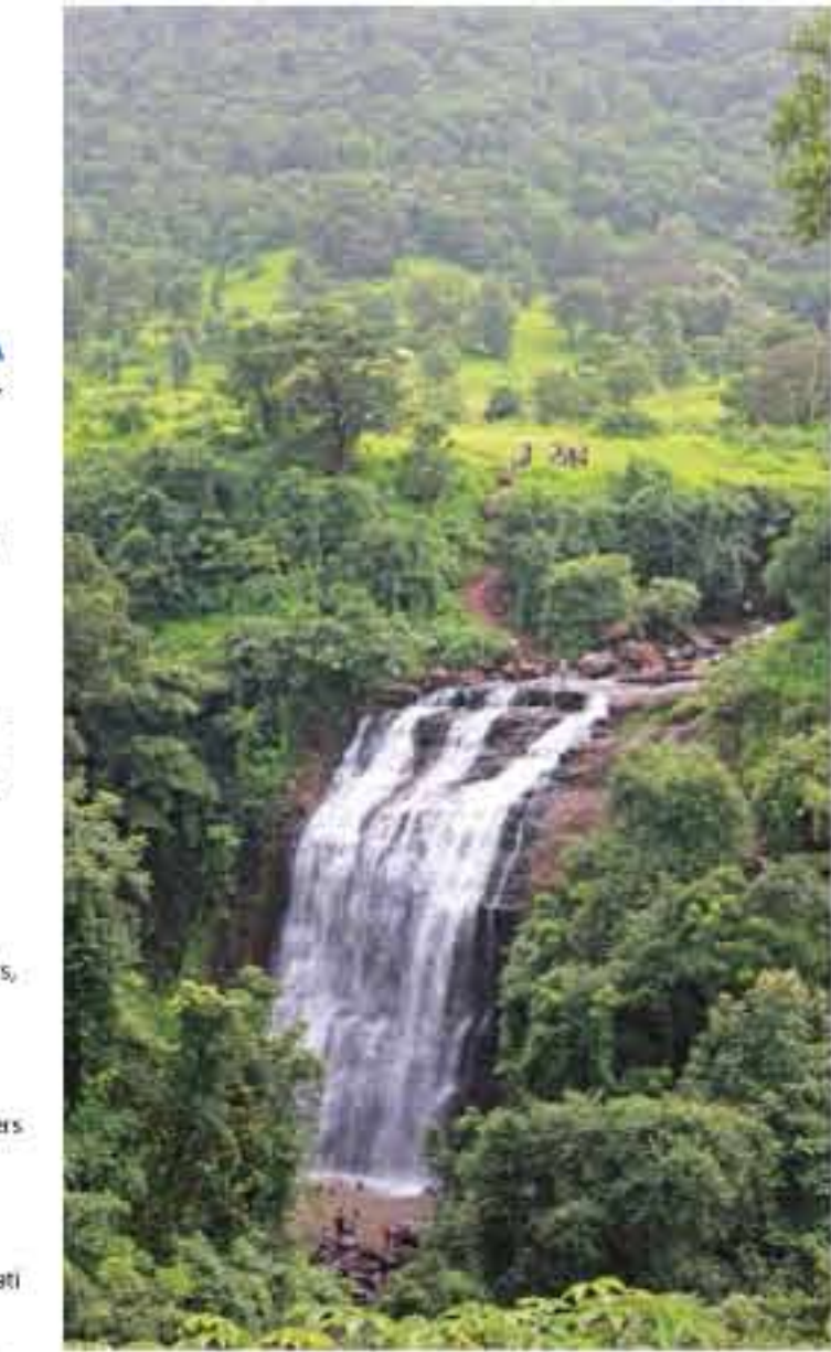
Above: A 120-ft high waterfall at Vihgaon, one of the premier rappelling destinations in Maharashtra. Left: Masmai Cave, near Cherapunjee, is one of Meghalaya's many natural limestone caves that are open for exploration.

Getting there: It's best to set up base at the state capital, Shillong. Jet Airways flies regularly to Guwahati from Delhi, Bengaluru, Kolkata and Ahmedabad. Shillong is a 2.5-hour drive (100 km) from Guwahati.